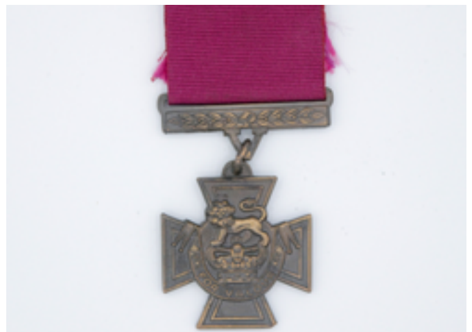
UPPER LEFT - Hat felt Gurkha. The iconic wide rimmed hat still issued to Gurkhas today. MIDDLE LEFT - Bugler of the Royal Gurkha Rifles submitted by Cpl Raju Tamang for the 2023 Brigade photography competition. LOWER LEFT - The khukuri and sheath of L/Cpl Tuljung Gurung MC from his Military Cross actions in Afghanistan. UPPER RIGHT - Two riflemen of 10th Gurkha Rifles in the jungle. MIDDLE RIGHT - Ambush in Sangin (Afghanistan). The Gurkha Museum is home to a vast collection of military artwork currently on display in the Museum. LOWER RIGHT - The Victoria Cross is awarded for valour in the presence of the enemy. In total 26 Victoria Crosses have been awarded to soldiers and officers within Gurkha regiments.