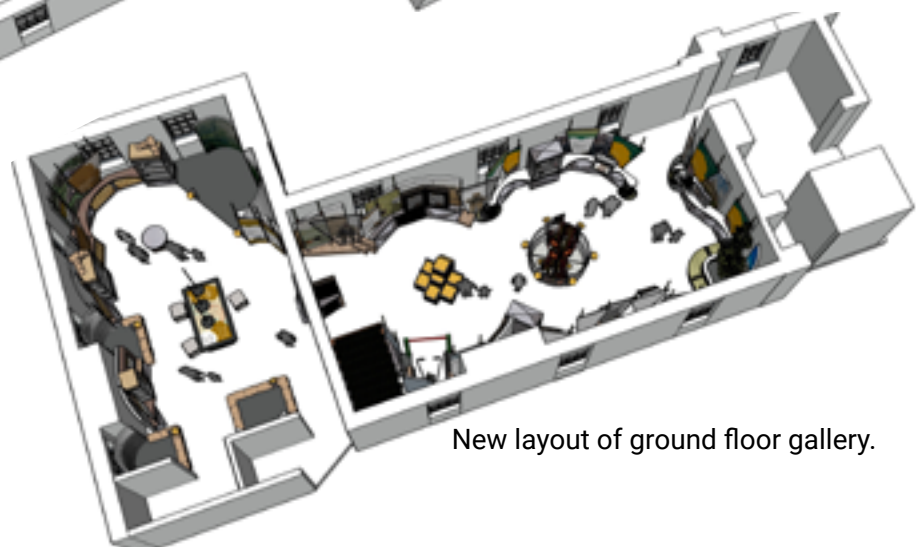
New layout of ground floor gallery.