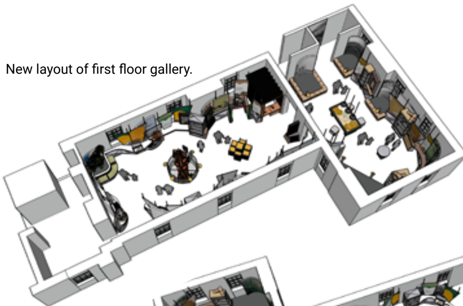
New layout of first floor gallery.

Visitors exit the exhibition space through the gift shop where all profits support the upkeep of the collection for future visitors.